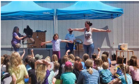
A single event can reach thousands of people!