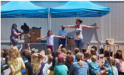
A single event can reach thousands of people!